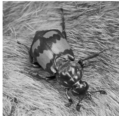
Sexton beetle

Parish Magazine adverts. Advertisers will be contacted very shortly with a view to re-advertising in the magazine. Advertising is the lifeline of the magazine so anyone wishing to advertise please make contact with the Clerk.